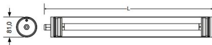
TR3 T5 1 TUBO / 2 TUBOS