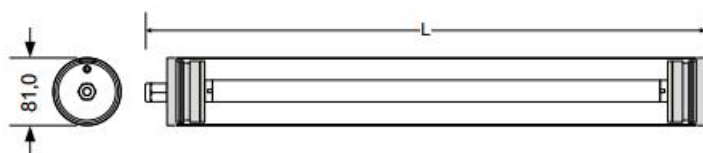
TR3 T8 1 TUBO / 2 TUBOS